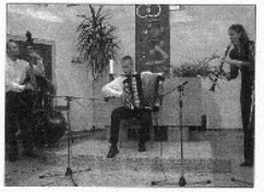
Das polnische Trio „Die Galtzyner Klezmerin“ macht das Abschlusskonzert der Reihe „Musik in alten Dorfkirchen“ in Nordhofen zu einem mitreißenden Erlebnis.